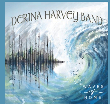
Waves of Home (2023)